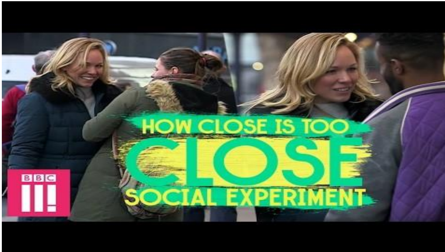
Invading Personal Space in Public | Social Experiment (YouTube Video) https://www.youtube.com/watch?v=sgJ24hknbHs